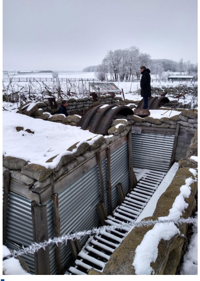
Mr Speake is seen here at a reconstruction of a trench network at Hooge.