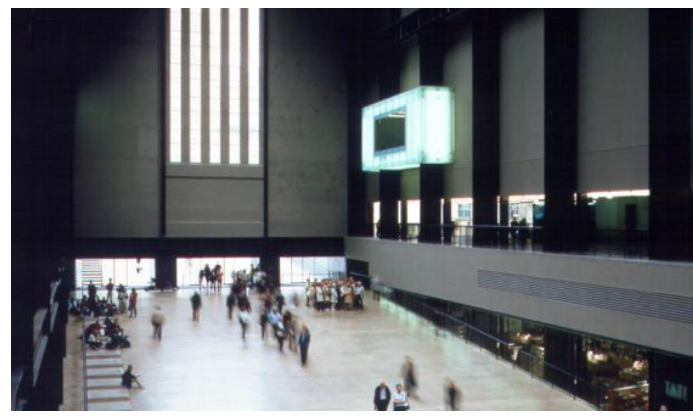
Above: Interiors of Tate Britain