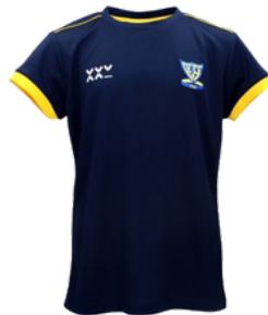
*Unisex or fitted t-shirt