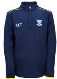
*Girls' curriculum midlayer

* These compulsory items are embroidered with the school logo, so they must be bought from Stevensons , or the pre-loved shop in school (contact Finance for details)