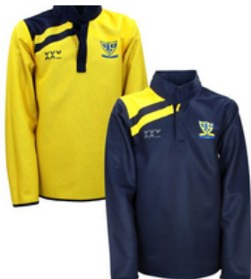
*Boys' curriculum reversible jersey

PE uniform may be worn to school on days when a student has a PE lesson, club or fixture.